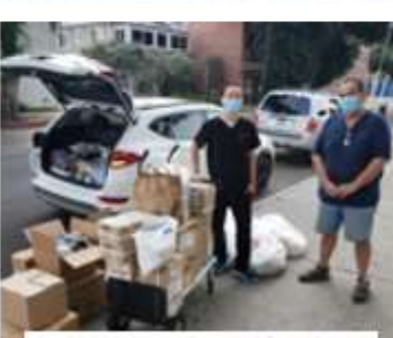
HSDA-USC donated essential goods in collaboration with Greater LA- HDA to the Latino Resource Organization for distribution to those most in need.