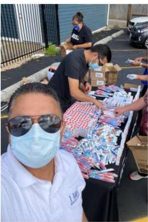
The Greater Chicago HDA Outreach event Back to School giveaway Aug 30