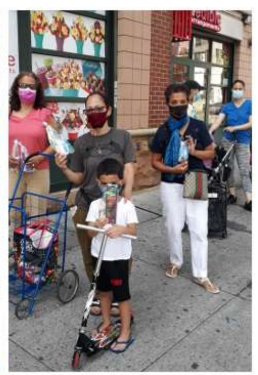
The New York HDA and The Hopeline Organization outreach event Aug 11