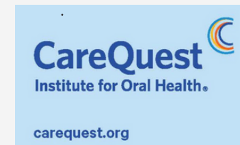
W 400 mm x 200 mm